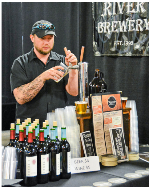
Beer and wine are available for purchase at Spotlight on Skagit.