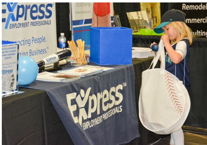
A young Spotlight on Skagit attendee gathers swag from a sponsor.