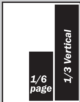
1/3 Vertical Page: 2.25"Wx10"H 1/6 Page: 2.25"Wx4.75"H

Choose one of five ad sizes. Provide us with your ad, or we will be happy to create one for you at no additional charge!