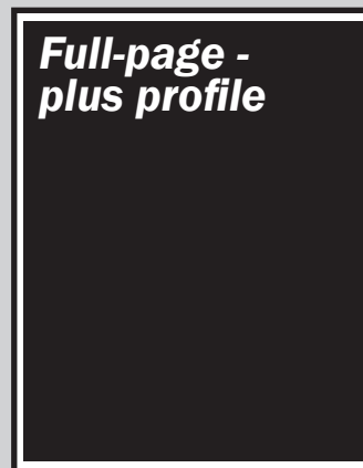
Full-page - plus profile Full Page: 7.5"Wx10"H With bleed: 8.75"Wx11.25"H

*Billed February 2024. Investors who purchase a half or full page will also receive a Q&A business profile.